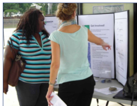
Project staff and citizen at CCT Transfer Center kiosk

On August 19, 2010 at the CCT Marietta Transfer Center, the Northwest Corridor project team hosted a staffed kiosk event, providing transit users with an opportunity to learn more about the project. While waiting for buses, citizens could review a project area map and typical sections, pick up a newsletter and a fact sheet, leave a comment, and speak with project staff about the project. Spanish and Portuguese interpreters were available. Project staff distributed over sixty newsletters and fact sheets. Comments heard from the public included “The reversible lane is a good idea to reduce the land needed” and “Great idea. Get it built soon”.