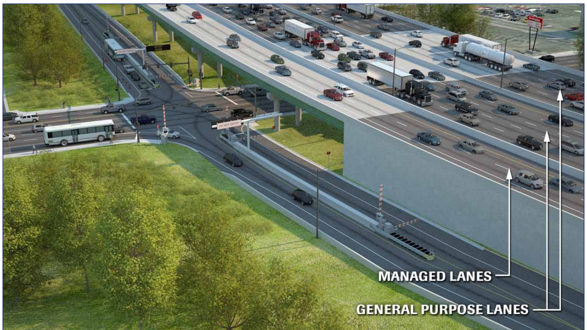
I-75 Managed Lane Interchange (South of I-575) – Simulation Looking North at Roswell Road

The SDEIS evaluates the potential effects of a new project alternative – the Two-Lane Reversible Alternative, also known as the Build Alternative, and compares it to the No-Build Alternative as required by the environmental process.