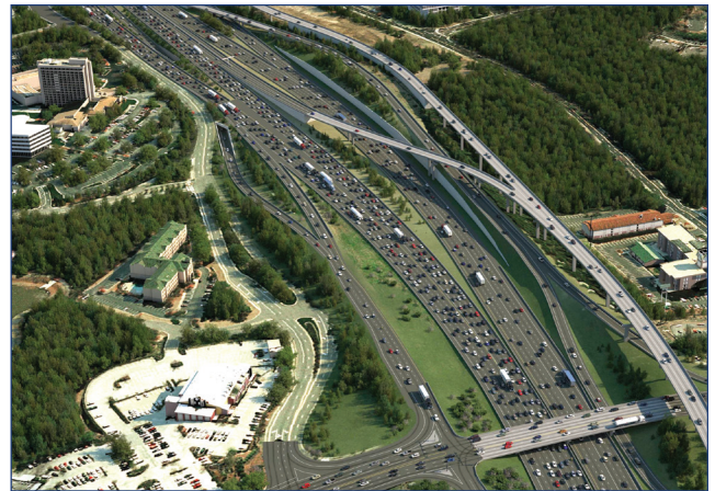
Artist rendering of the Managed Lane System Flyover at Windy Hill Road

Since then, Georgia DOT has made important changes: the project remains a P3, but the method of delivery has changed to Design-Build-Finance (DBF). DBF is more streamlined, requires less private financing, provides greater state control and still allows benefit from the investment, innovation, and expedited delivery of a P3. The private partner will contribute initial funding of 10 - 20 percent of the total project cost, and be responsible for design and construction of the project. The state will provide oversight of the construction and retain responsibility for operations and maintenance of the roadway, tolling and long-term financing. The state will repay the private partner after the facility is open to traffic. DBF addresses the Governor's major concern: the state will be able to implement additional transportation solutions in the corridor as needed. Under this delivery process, the project is moving forward with full support from Governor Deal, Georgia legislators, and the State Transportation Board.