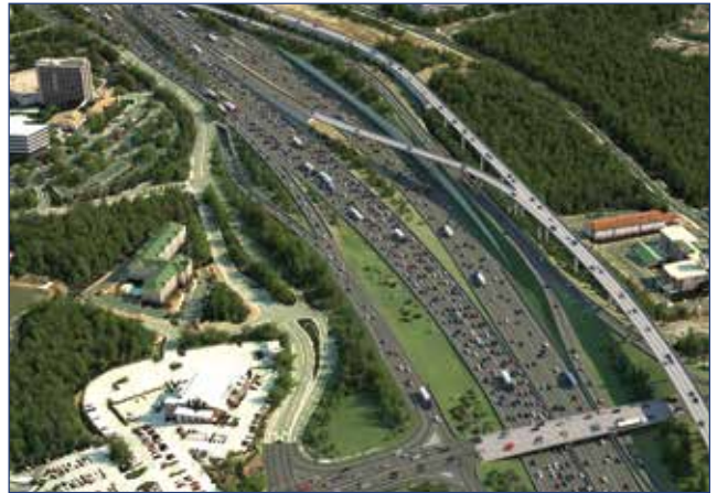
Artist rendering of the Managed Lane System Flyover at Windy Hill Road

As the next step in the environmental process, a determination on the project's concept, known as the Record of Decision (ROD), is expected to be issued by the Federal Highway Administration (FHWA) in the second quarter of 2013. The ROD will identify the alternatives considered, including the no-build; the selected alternative; list and describe any measures needed to minimize effects to the natural, human and built environments, and contain the comments received since the publication of the Final Environmental Impact Statement and the responses.